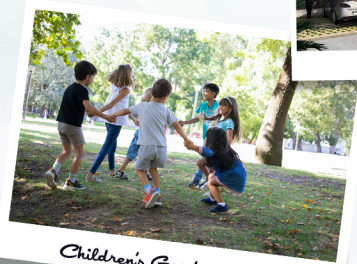
Children's Garden Area