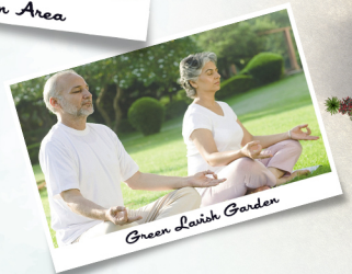
Green Lavish Garden